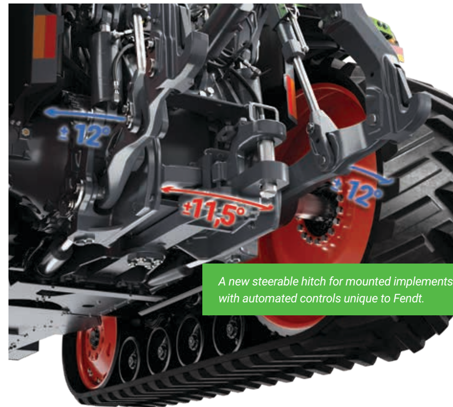
A new steerable hitch for mounted implements with automated controls unique to Fendt.

For three-point-hitch-equipped tractors, with either standard or high-lift capacities, the hitch system was designed with the mounted implement in mind. The hitch system has auto float, fixed or offset mode, which gives the operator total control of