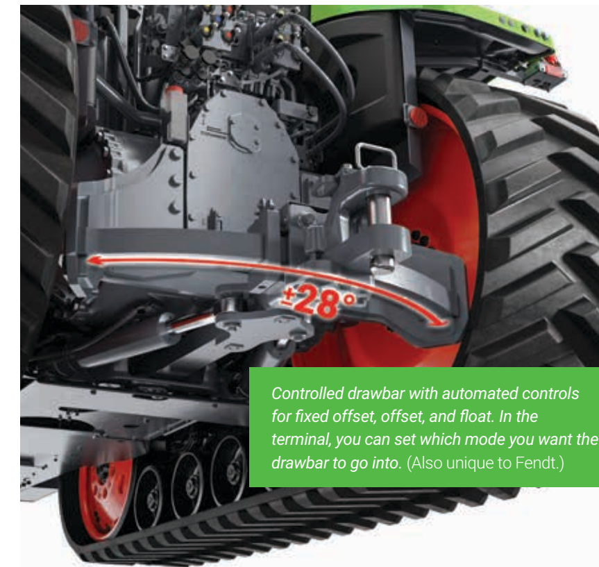
Controlled drawbar with automated controls for fixed offset, offset, and float. In the terminal, you can set which mode you want the drawbar to go into. (Also unique to Fendt.)

For three-point-hitch-equipped tractors, with either standard or high-lift capacities, the hitch system was designed with the mounted implement in mind. The hitch system has auto float, fixed or offset mode, which gives the operator total control of