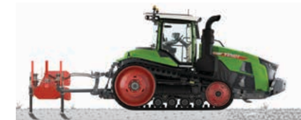
Figure 2: The 1100 Vario MT with Smart Ride Plus allows for easy adjustment of the weight distribution. This results in reduced slip, improved ride comfort, and improved overall performance.