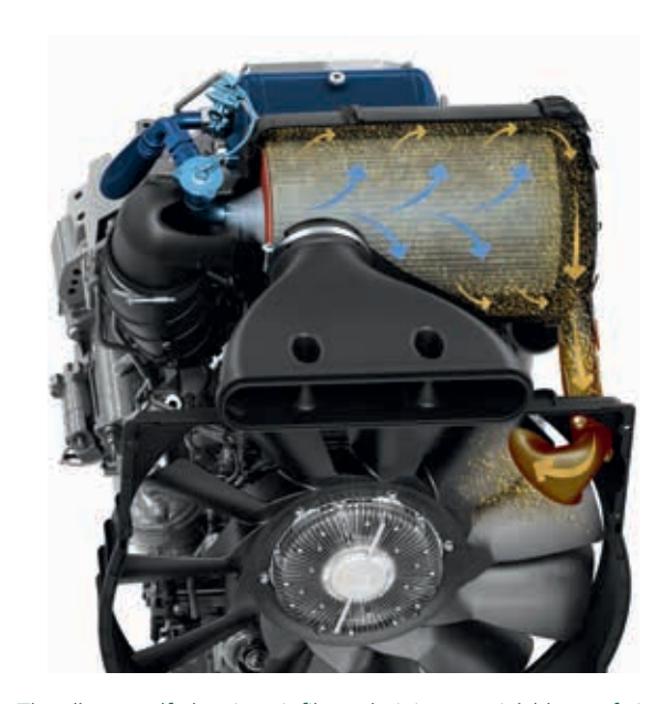
The all-new self-cleaning air filter administers quick blasts of air through the filter while operating to keep clean. This reduces maintenance and improves reliability.