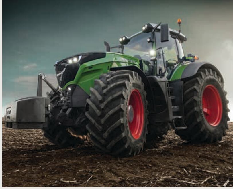
Fendt Stability Control (FSC) takes steering precision, driving stability and braking safety to new levels. At speeds above 12.4 mph (20 km/h), FSC locks the front axle suspension cylinders and dampens side-to-side movement to ensure maximum stability in transport. When speeds drop below the FSC threshold, it automatically disengages to ensure maximum ground contact with all four tires.