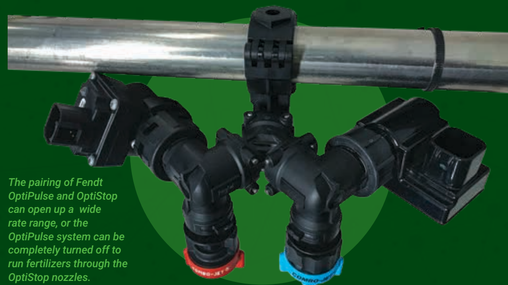
The pairing of Fendt OptiPulse and OptiStop can open up a wide rate range, or the OptiPulse system can be completely turned off to run fertilizers through the OptiStop nozzles.

The Fendt OptiPulse™ nozzle control system can be paired with the OptiStop control system to increase flow and control capabilities of the system. Control modes such as variable pressure, bypass or tiered nozzles increase the versatility of the system.