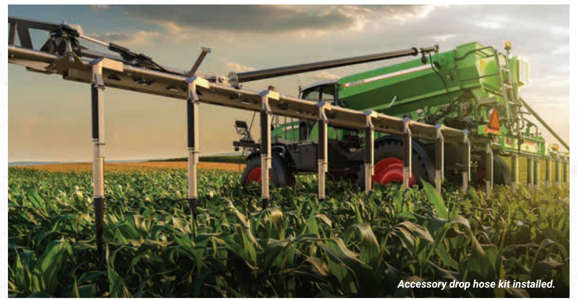
Accessory drop hose kit installed.