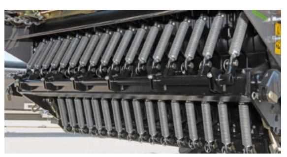
You can also opt to have the cutter unit pivot hydraulically from its working position to service mode.