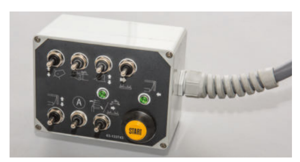
With the electromagnetic comfort control, all functions can be carried out from the cab.