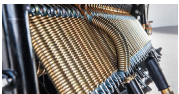
Each knife is fully protected with the Trimatic foreign-body guard system, also available on the Fendt Tigo ST, S and MS.