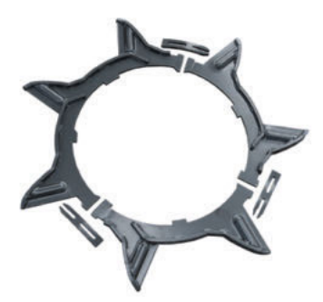
The rotor teeth are divided into three elements and can be removed individually. Three new elements are locked for simple replacement and then welded three times with individual locks.