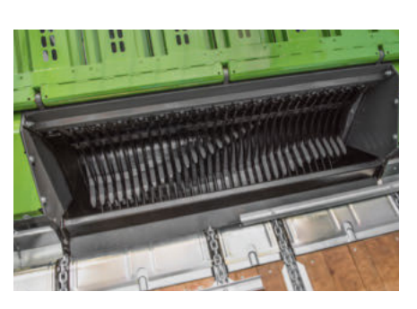
The rotor with a diameter of 800 mm and six spiral rows of teeth made of Hardox steel is equipped on both sides with large spherical roller bearings.