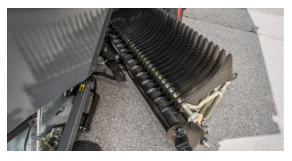
The central knife release allows you to change individual knives quickly and easily.