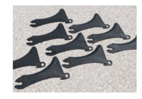
The elongated knives with serrations on one edge ensure an efficient, pulling cut, and can be removed without the use of tools.