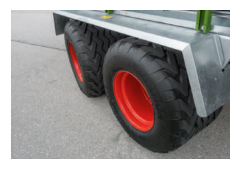
Optional self-steering can be retrofitted for all models.