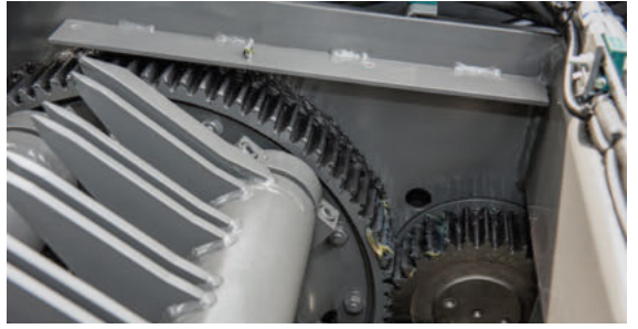
The swing-arm unit is powered with low-wear gears with extra strong spur gears.