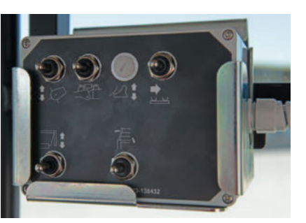
The electromagnetic quick-controls give you all the functions you need from the comfort of the driver's seat.